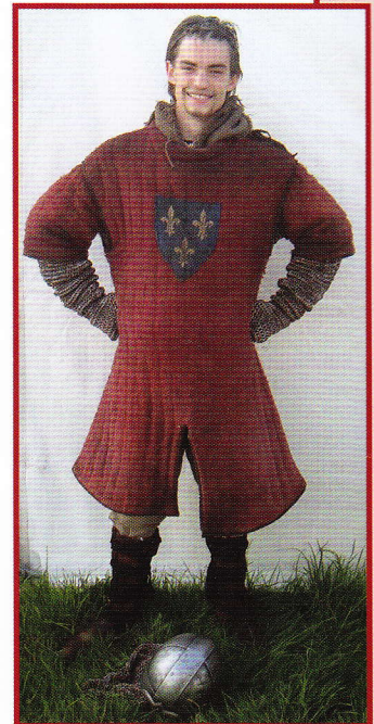
Ready for filming on set of the new Robin Hood movie!