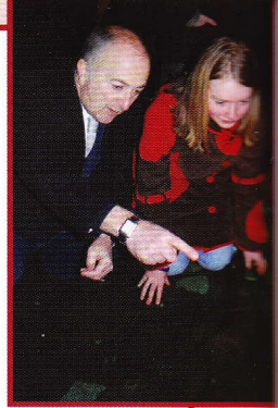
Everyone gave the new-look JORVIK a big thumbs up!

Remember YAC UK members can get free entry to JORVIK with their membership card and YAC Pass. Check out your booklet for full details!!