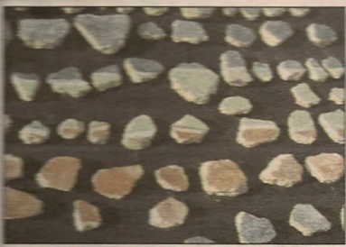
SEARCH: Part of a mosaic found on site in Litlington. 599103 Below, excavation work on site. 599092