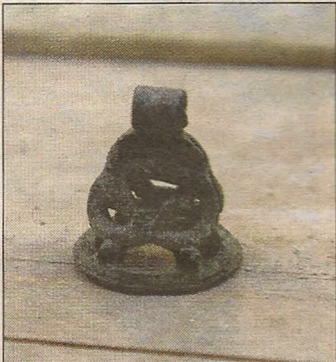
LITTLE THINGS: Finds give an insight into the past. 599088

Fascinated villagers being shown around the site last night were told the villa, thought to date from the late Roman period, was smaller than thought and in a different location from that